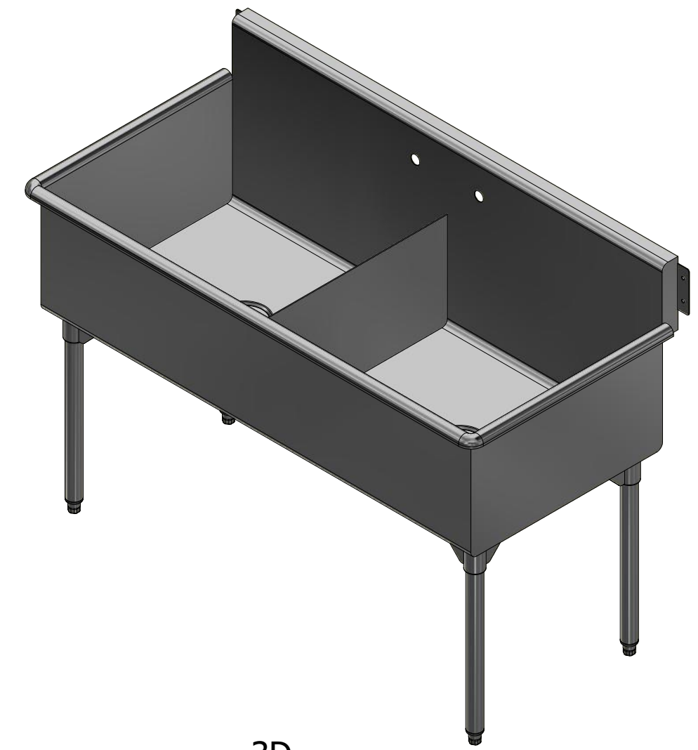
3D SCALE 1/12